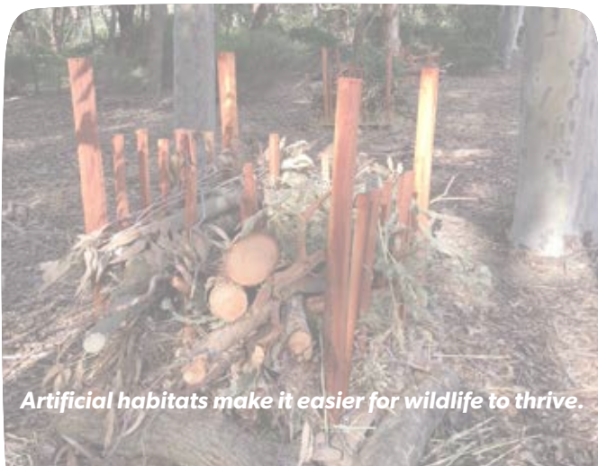
Artificial habitats make it easier for wildlife to thrive.

Your property can become an important environmental resource, and we'll provide you with the best information for your place.