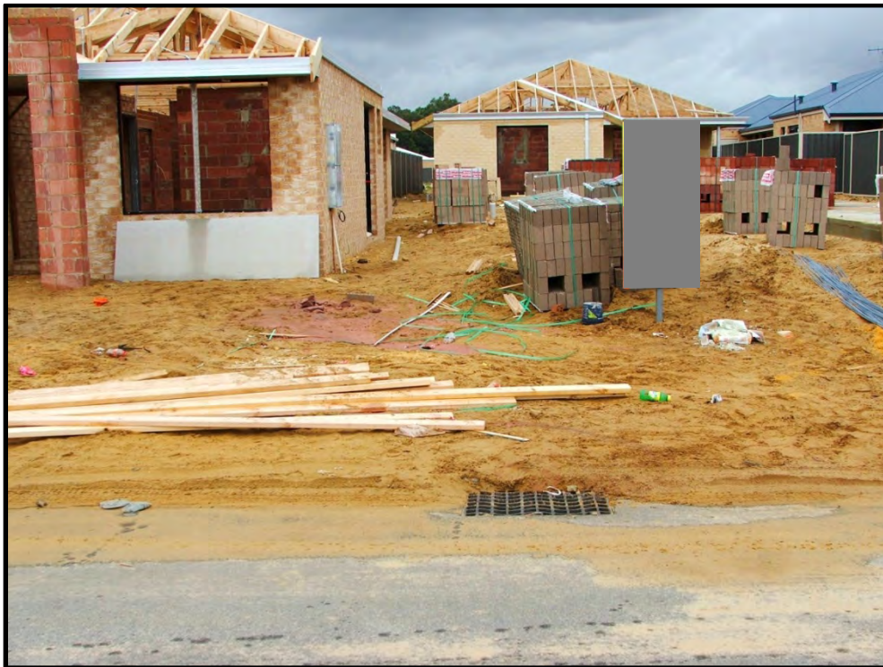
Figures 12 and 13: Sand drift from poor site management is delivered directly to stormwater infrastructure