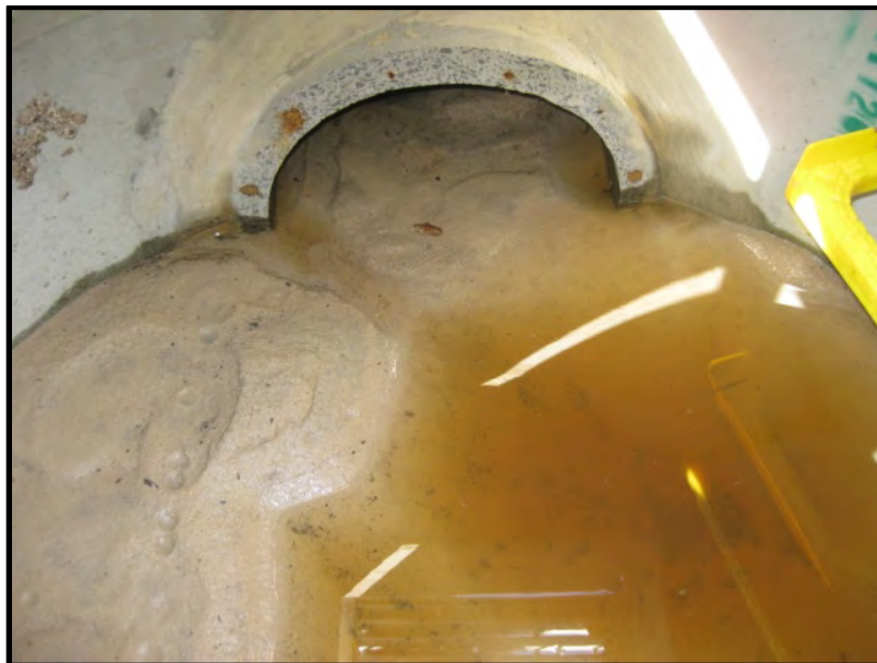
Figure 3: Silt trap and pipes filled with sediment