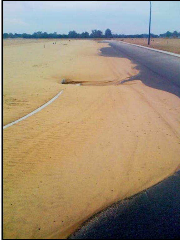
Figure 2: Sand drift and erosion to stormwater entry pit