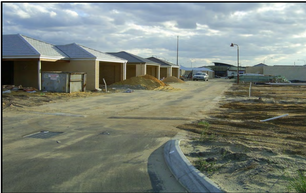
Figure 10: Poor site management delivers sand to the stormwater system.

The construction of residential dwellings, particularly in new subdivisions, has been observed in this study to be a significant and consistent contributor to sediment loads in stormwater networks.