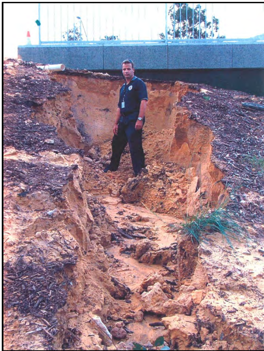
Figure 8: Erosion associated with the construction of the Tonkin Highway

The matter of the recent construction of the 2003-2005 Tonkin Highway extension from Mills Road West in Gosnells to South Western Highway, Mundijong, for which development approval was not required, has been cited as an example of inadequate erosion management. Several instances of serious erosion and sedimentation of the Canning River were recorded by the Cities of Armadale and Gosnells during the development's lifetime.