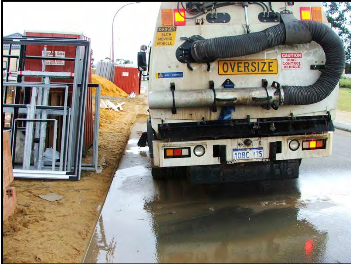
Figure 7: Street sweeping removes sand drift from the roadway, but poor site management will see its return

Further, the matter of responsibility for street sweeping following the completion of civil works and into the housing construction phase, when significant amounts of sand drift, erosion and sedimentation can occur, remains unclear.