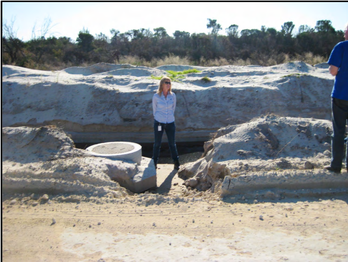
Figure 9: Erosion from sewer works into branch drain leading to the Southern River

In a similar vein, poor management of the construction of a sewer main in Balfour Street, Gosnells resulted in significant erosion material being delivered to the Sutherlands Park branch drain, which feeds into the Southern River. In this instance, a number of infringements for sediment discharge were issued by the DEC under the Environmental Protection (Unauthorised Discharges) Regulations 2004.