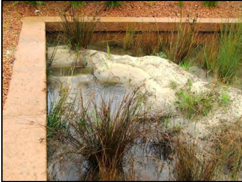
Figure 4: Sediment damage to rain garden

The release of sediment is generally not ongoing once development is completed. Researchers in Queensland estimate that around 90% of cumulative soil loss or sand drift over the first 20 year life of an urban subdivision occurs during the first five years - the land clearing, earthworks and construction periods (Matthews, 2008). This research also argues that the construction phase provides the most cost-effective opportunity for the management of erosion and sediment. However, it is also noted that government funding for research and capacity building is primarily allocated to operation and maintenance of the urban built form (i.e. post-construction).