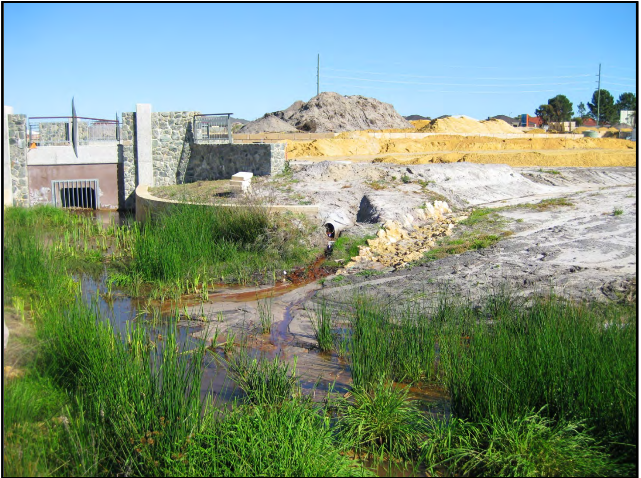
Figure 5: Erosion and sediment runoff into a drain during subdivision works

Poor management of subdivision works can result in significant sand drift, mobilisation of sediment to the stormwater system by water or wind, and clogging of silt traps, pipes, swales and rain gardens. Figure 5 shows the results of poor controls over practices during subdivision works.