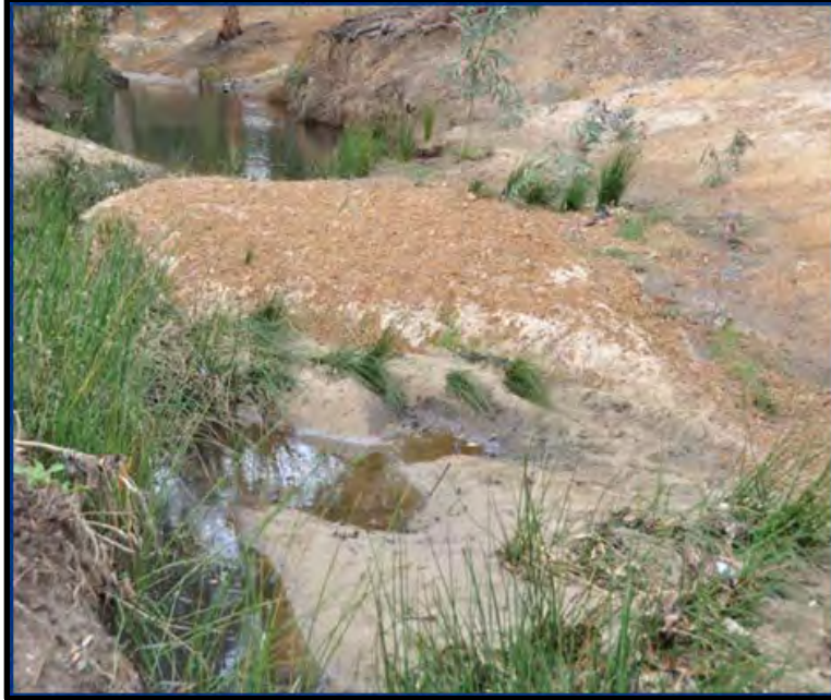
Figure 1: Sedimentation altering natural hydrology occurring along the Canning River

Loss of sand from development sites also has the potential to impact on newly constructed stormwater management infrastructure, including areas with water sensitive urban design treatments. This decreases their effectiveness, and often leads to maintenance works to re-establish the infrastructure, with the cost generally borne by local government (unless within the two year care and maintenance period).