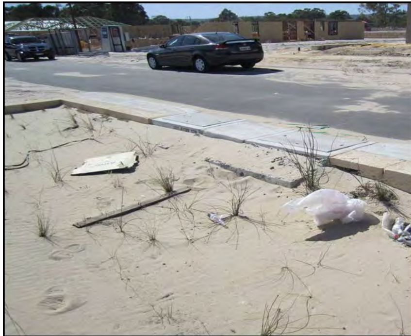
Figure 6: Rain gardens impacted by sand drift

Street sweeping, to remove sand from roadways and prevent its entry to stormwater infrastructure, has proven a difficult control to prescribe. The required frequency of prescribed street sweeping is difficult to establish. There is no known evaluation of the method's effectiveness or guidance as to optimum intervals between sweeping. The requirement for frequency of street sweeping varies between local governments. In the case study area, street sweeping is generally required at intervals of between 2 - 4 weeks.